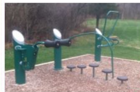
Equipment at Station 3: